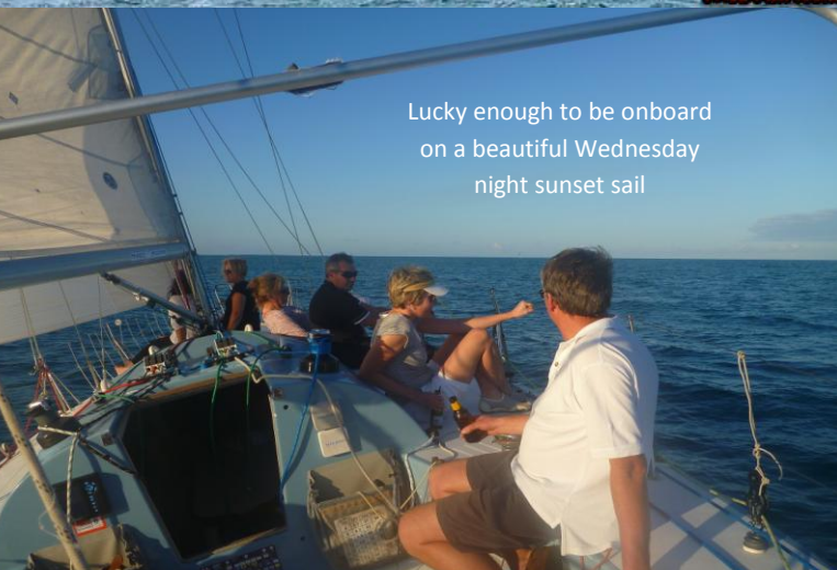
Lucky enough to be onboard on a beautiful Wednesday night sunset sail