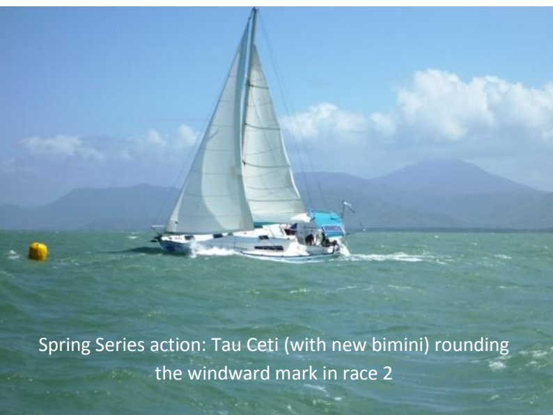
Spring Series action: Tau Ceti (with new bimini) rounding the windward mark in race 2